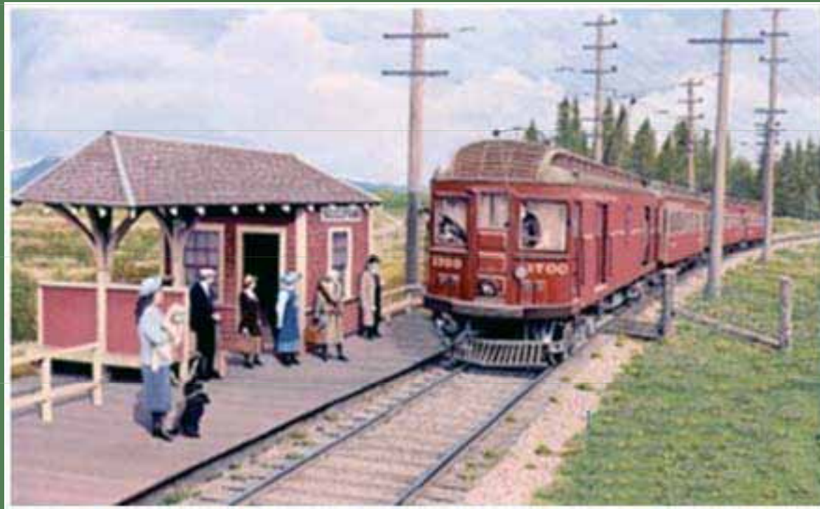
Surrey, Metro Vancouver, BC. Canada